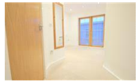
Two Bedroom Apartment*** Offered on an unfurnished *** City Centre*** Two Bathrooms*** Hungate Development*** No Sharers***No Students***Available April 2024***