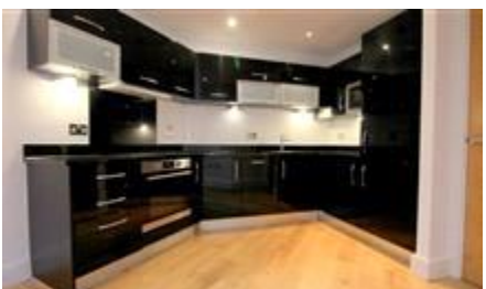
Cordwainers Court, Black Horse Lane, York £1,250 pcm