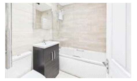
*** A Lovely One Bedroom Apartment*** Situated In The City Centre, Just Off Walmgate*** Secure Parking Space For One Car*** Decorated And Re-Carpeted Throughout*** Offered Unfurnished*** Available March 2025***